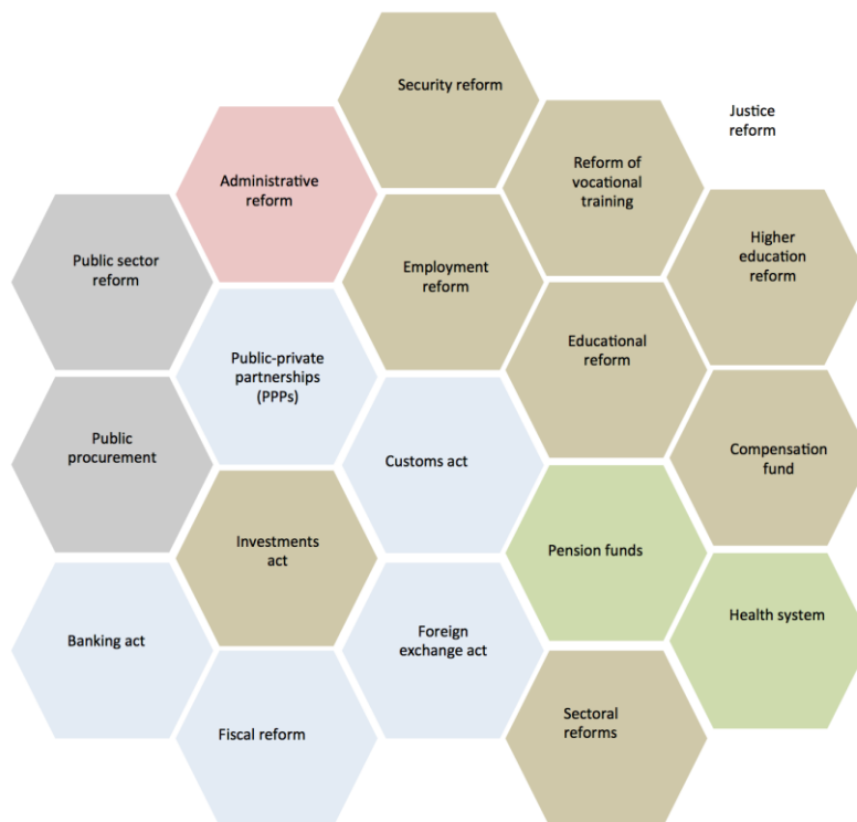
Figure 3: Proposed economic and social reforms in Tunisia