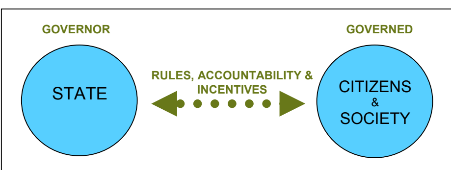
Figure 2: Governance, state and society

Domestic accountability is the ability of the governed to demand answers and to enforce sanctions on the governors. It is central to achieving this balance between citizens/society and the state. The arrangement of institutions and organisations that enable citizens to hold the state to account – the inner workings of domestic accountability – can generate the incentives needed to ensure that the state implements policies and allocates resources in ways that respond to the needs of its citizens. So, for example, if Parliament