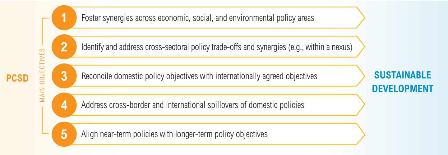
Figure 3 | Policy Coherence for Sustainable Development