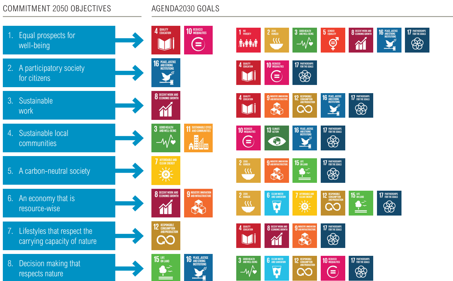
Figure 3 | Finland: 2050 SD Commitments Aligned with the SDGs