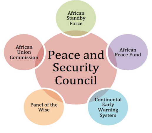
Figure 3: Components of the APSA

The African Union has strong mandates to engage in and mediate high-intensity conflicts across the continent. As noted above, the AU Constitutive Act provides the legal basis for the AU to intervene in member states to protect the principles enshrined in the Act. The Protocol Relating to the Establishment of the AU's Peace and Security Council<sup>44</sup> outlined the different components of the APSA and their function (see Figure 3).45