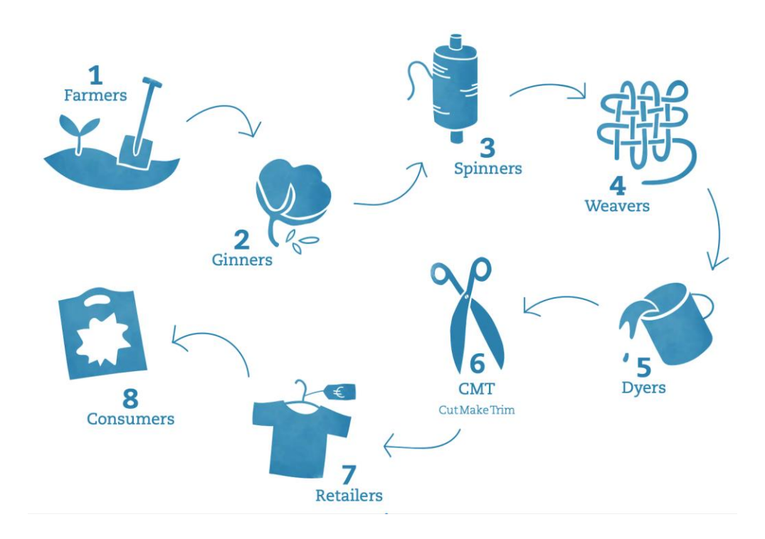
Figure 1: Value chain for textiles