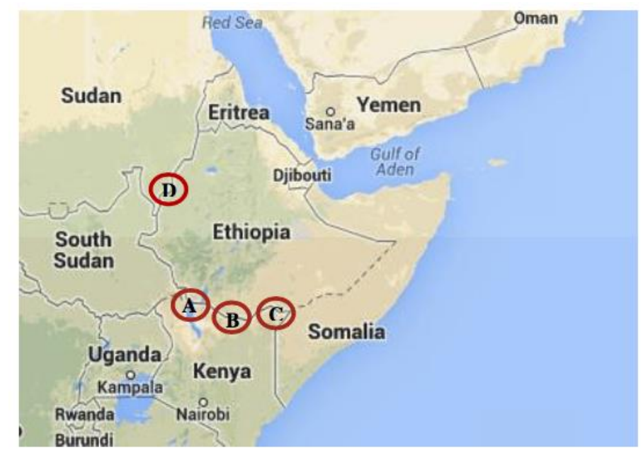
Figure 1: Target areas of the EU Trust Fund funded project 'Collaboration in Cross-Border Areas of the Horn of Africa Region'

As part of IDDRSI, Swiss Development Cooperation (SDC) committed USD 10m for over five years to support cross-border programmes<sup>14</sup>. The programmes will work on animal health, trade and natural resources management coordination and involve community engagement on policy and investment as well as cross cutting areas of work such as conflict, gender and nutrition. The supported programmes will target cross-border in Ethiopia (Liben), Kenya (Mandera) and Somalia (Gedo) and include the watershed of the Dawa River on the Ethiopia-Somalia and Ethiopia-Kenya border. Germany established a Regional Drought Resilience Fund which will be implemented through the German Development Bank KfW under IGAD.