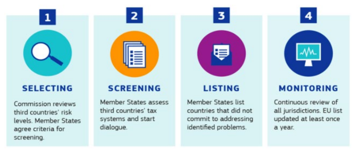
Figure 3: The EU listing process of non-cooperative tax jurisdictions 19