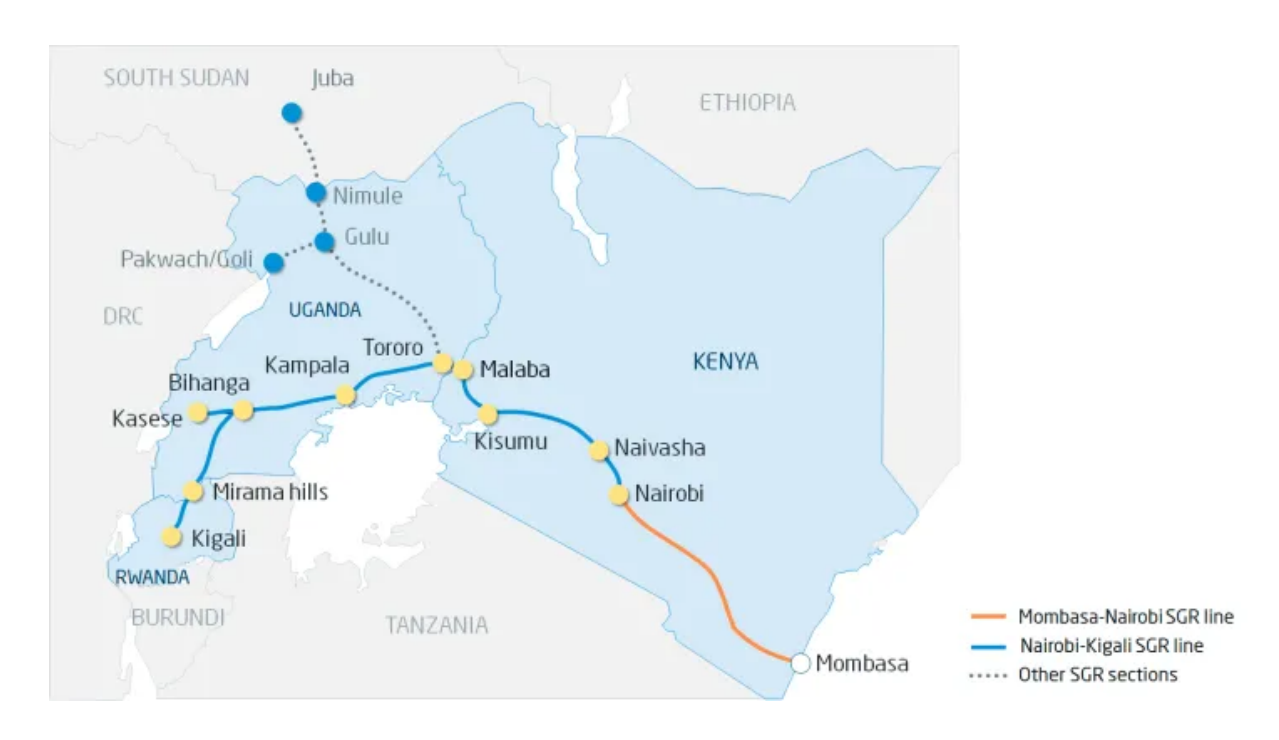
Figure 6: SGR Route planned and operational