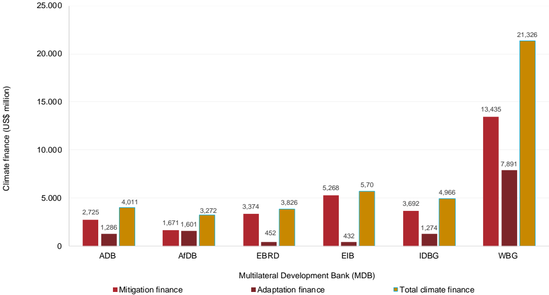
Figure 2: MDBs adaptation finance as a proportion of total climate finance (2018; US$ million)