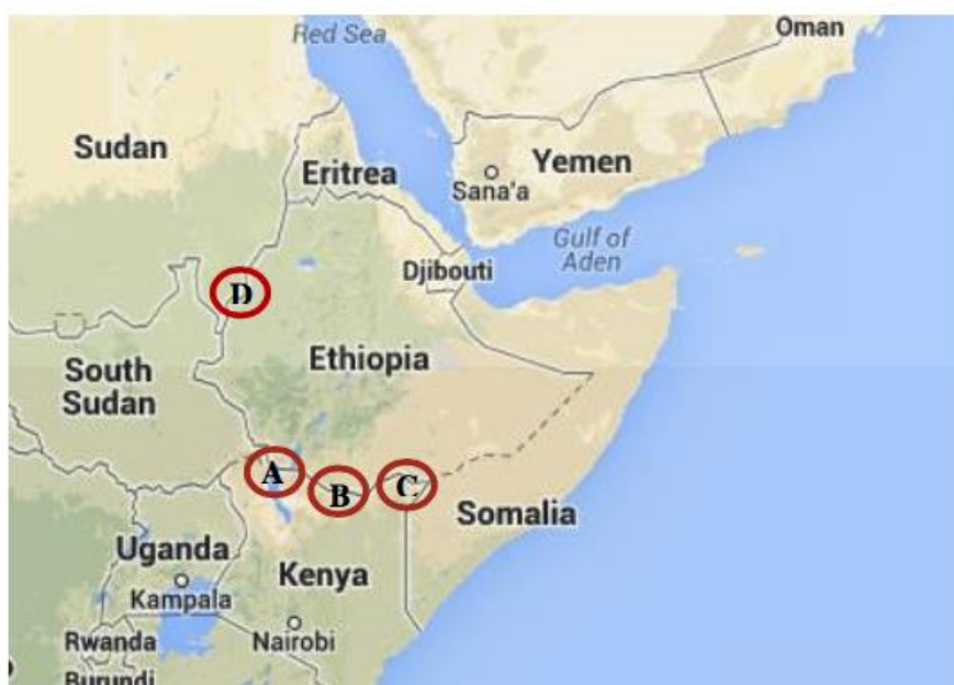
Figure 1: Target areas of the EU Trust Fund funded project ‘Collaboration in Cross-Border Areas of the Horn of Africa Region’

As part of IDDRSI, Swiss Development Cooperation (SDC) committed USD 10m for over five years to support cross-border programmes 14 . The programmes will work on animal health, trade and natural resources management coordination and involve community engagement on policy and investment as well as cross cutting areas of work such as conflict, gender and nutrition. The supported programmes will target cross-border in Ethiopia (Liben), Kenya (Mandera) and Somalia (Gedo) and include the watershed of the Dawa River on the Ethiopia-Somalia and Ethiopia-Kenya border. Germany established a Regional Drought Resilience Fund which will be implemented through the German Development Bank KfW under IGAD.